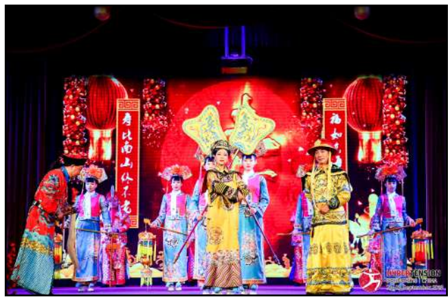
Presidential Dinner entertainment depicting Chinese history over the years