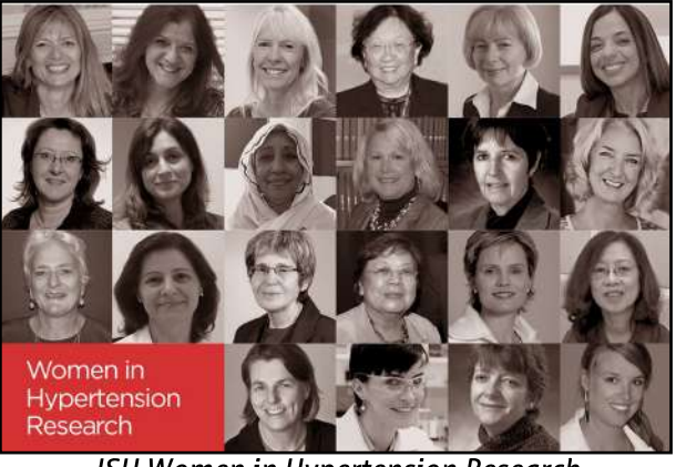
ISH Women in Hypertension Research