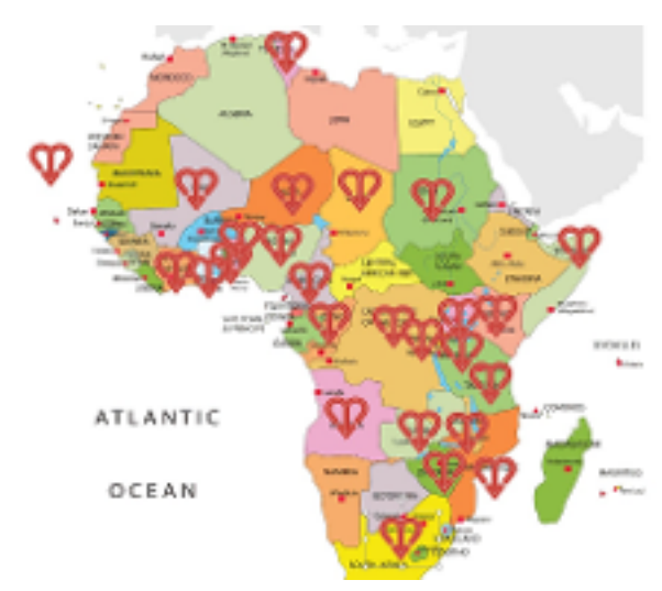
The hearts indicate countries in Africa committed to MMM

Meanwhile, the App onto which the data will be entered, and a bespoke MMM website, are being developed and both should be ready by the end of February. In a shorter time-frame we will have a protocol in English (and Chinese) to distribute to all collaborating countries for local adaptation.