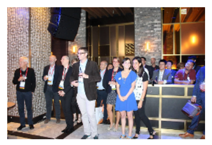
ISH NIC Networking and Mentorship Event, Seoul, September 2016

A critical compliment to the strong basic content is the fact that many of the more clinically focused ISH members show a genuine respect for basic research and are very interested in discussing pathways to translation of this work. This has been significant in my personal career development as interactions with several senior clinician scientists in ISH have educated me in clinical practice and current challenges. This knowledge has allowed me to better focus my research in terms of unmet clinical needs. The ability to interact with these individuals (too numerous to mention) is a direct result of the intimate, supportive environment that the ISH cultivates. Events such as the always well-attended New Investigator Sessions and Networking events opened many doors within the Society and I am pleased to see the continuation of this investment with the next generation of new investigators.